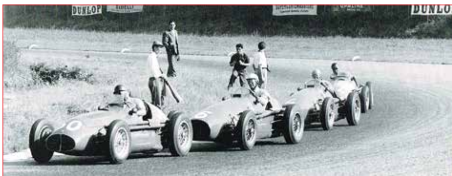
Fangio leads Farina, Ascari and Marimon in their slipstreaming battle.

The officials, who had probably already written Ascari down as the winner, were so astonished that they forgot to wave the chequered flag, so Fangio continued for another lap flat out to make sure he kept ahead of Farina, who finished second.