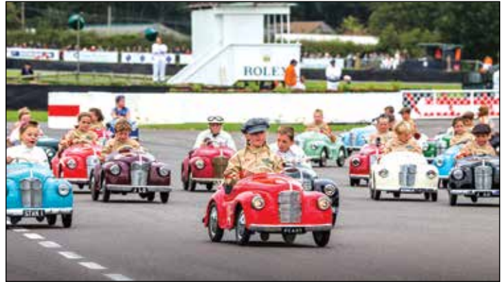
A fleet of J40 pedal cars in the Settrington Cup at the Goodwood Revival Race Meeting

Well, they certainly exist and they literally swarmed this online-only auction, resulting in some shall we say surprising figures for the brightly coloured miniature cars.