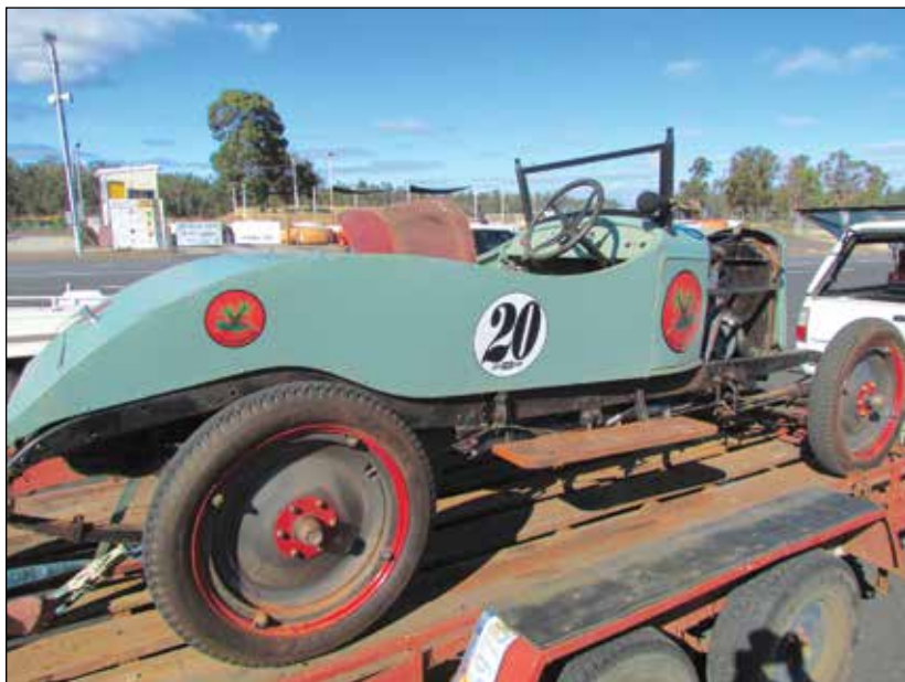
Paul Martin's Grasshopper Chevrolet still showing signs of Perkolilli red dust on car and trailer