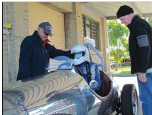
Grandfather-Grandson briefing for the MG TC monoposto