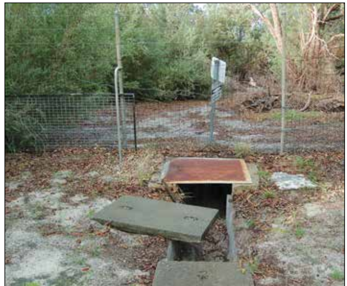
The slab that was removed to allow the copper cable to be drawn through from the connection box on the main building. Note the hole in the fence, since fixed by Peet's contractor.