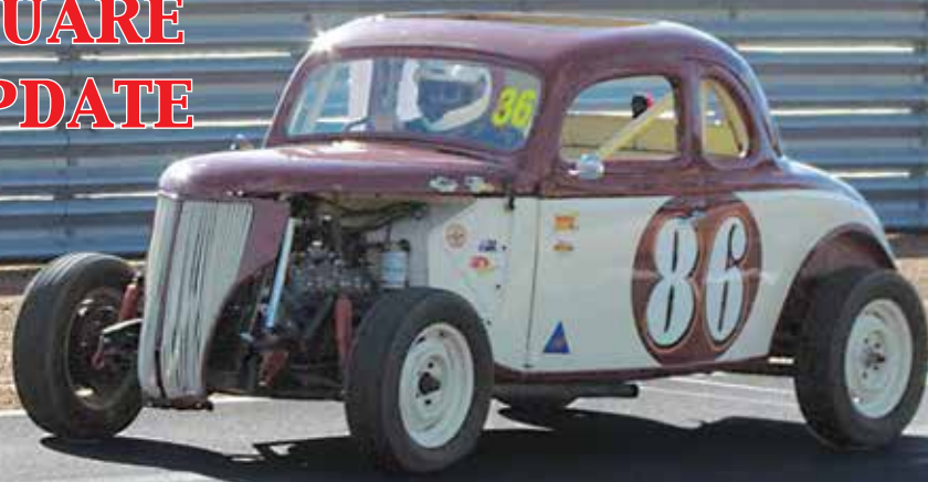
Matt Steber stretches the legs of the 1936 Ford coupé