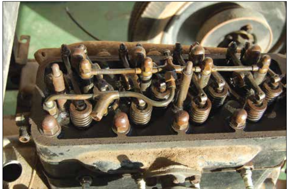
The top-end of the engine, showing the oil pipes that conduct the lubricant to the rockers and valve gear. Note that the rockers are pivoted on individual shafts mounted to pillars on the head – no rocker shaft here.

The future of the trailer is unsure. There is nothing the club needs it for, so it might be sold to help maintain the club finances after the loss of income from events this year due to the COVID-19 pandemic.