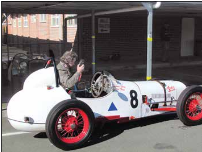
The Fry family Austin Seven Special in the paddock ready to go.