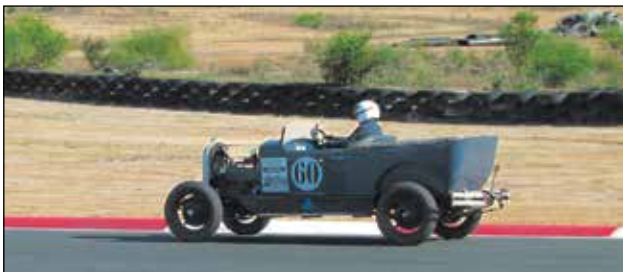
The Peter Harrold Chrysler having a post-Perkolilli workout on blacktop

form and faster than the driver's ability to control it.